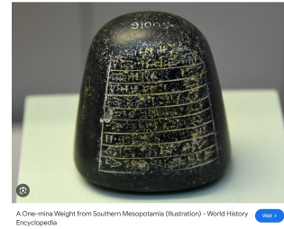
A One-mina Weight from Southern Mesopotamia (Illustration) - World History Encyclopedia

מֵנֵא מֵנֵא טֶקֶל וּפְרִסִין)" Jewish Encyclopedia, is good on the linguistic details, which are obscure. The language was Aramaic, which is written without any vowels. Lacking vowels, the words are ambiguous.