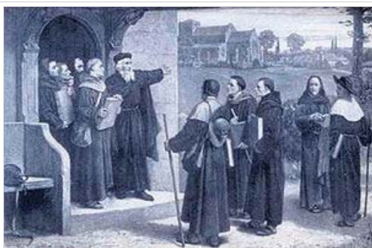
Wycliffe speaking to Lollard preachers.

It was in this period that Wycliffe came significantly to the fore. He was among those to whom the thought of the secularization of ecclesiastical properties in England was welcome. His protector was John of Gaunt, who was acting as ruler at this time. He was no longer satisfied with his chair as the means of propagating his ideas, and soon after his return from Bruges he began to express them in tracts and longer works – his great work, the Summa theologiae , was written in support of them. In the first book,