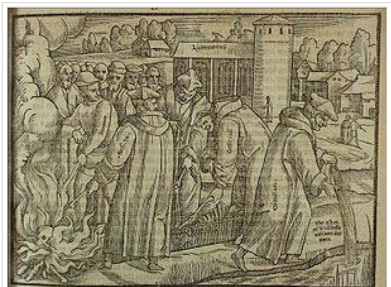
Burning Wycliffe's bones, from John Foxe's Book of Martyrs (1563)

The Council of Constance declared Wycliffe (on 4 May 1415) a stiff-necked heretic and under the ban of the Church. It was decreed that his books be burned and his remains be exhumed. The exhumation was carried out in 1428 when, at the command of Pope Martin V, his remains were dug up, burned, and the ashes cast into the River Swift, which flows through Lutterworth. This is the most final of all posthumous attacks on John Wycliffe, but previous attempts had been made before the