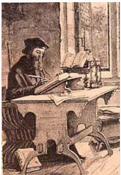
John Wycliffe at work in his study

Wycliffe's first encounter with the official Church of his time was prompted by his zeal in the interests of the State. His first tracts and greater works of ecclesiastical-political content defended the privileges of the State, and from these sources developed a strife out of which the next phases could hardly be determined. One who studies these books in the order of their production with reference to their inner content finds a direct development with a strong reformatory tendency. This was not originally doctrinal; when it later took up matters of dogma, as in the teaching concerning transubstantiation, the purpose was the return to original simplicity in the government of the Church. But it would have been against the diplomatic practice of the time to have sent to the peace congress at Bruges, in which the Curia had an essential part, a participant who had become known at home by his allegedly heretical teaching.