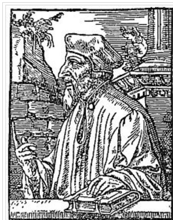
John Wycliffe portrayed in Bale's Scriptor Majoris Britanniae 1548.

National honor seemed to require an English translation, since members of the nobility possessed the Bible in French. Portions of the Bible had been translated into English as early as the seventh century under the auspices of the Catholic Church. While Wycliffe is credited, it is not possible exactly to define his part in the translation, which was based on the Vulgate. [17] There is no doubt that it was his initiative, and that the success of the project was due to his leadership. From him comes the translation of the New Testament, which was smoother, clearer, and more readable than the rendering of the Old Testament by his friend Nicholas of Hereford. The whole was revised by Wycliffe's younger contemporary John Purvey in 1388. Thus the cry of his opponents may be heard: "The jewel of the clergy has become the toy of the laity."