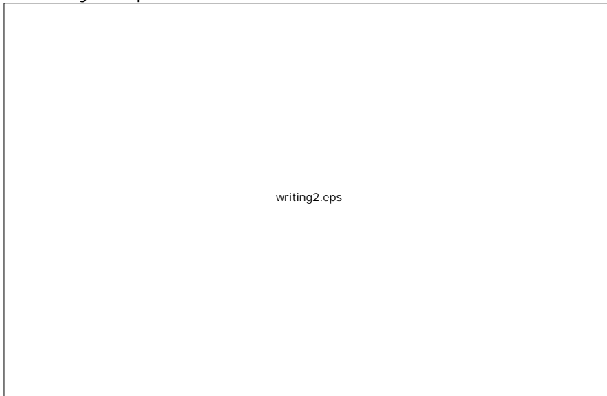
Figure 2: Misusing Your Budget Constraint, Paperwise

White space on the page is part of the writing too. This is obvious in tables and figures. Do you feel any temptation to fill up your figures with text in order to save space, as in Figure 2? If you don't, don't feel any compulsion to do so in the tables or text either.